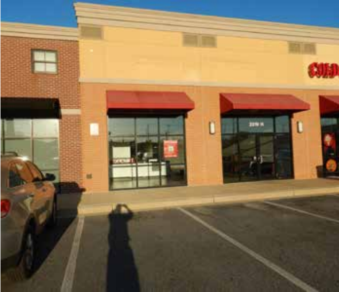
Former 5 Guys Burger and Fries 2,226 SF (31.5'X70.67') Gas heat

2319-H Hanover Pike, Hampstead, Maryland